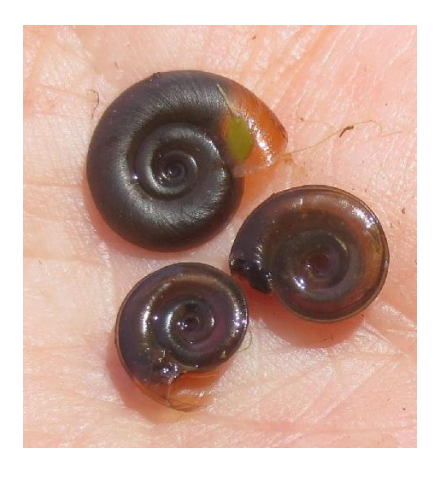
Ramshorn snail, Planorbis planorbis