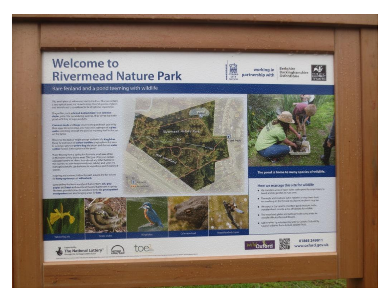
At site entrance

Two explanatory boards were installed, one near the entrance and one, detailing the pond life, next to the pond. These now assist all visitors in understanding the importance of the wildlife on site and the reasons for conservation work.