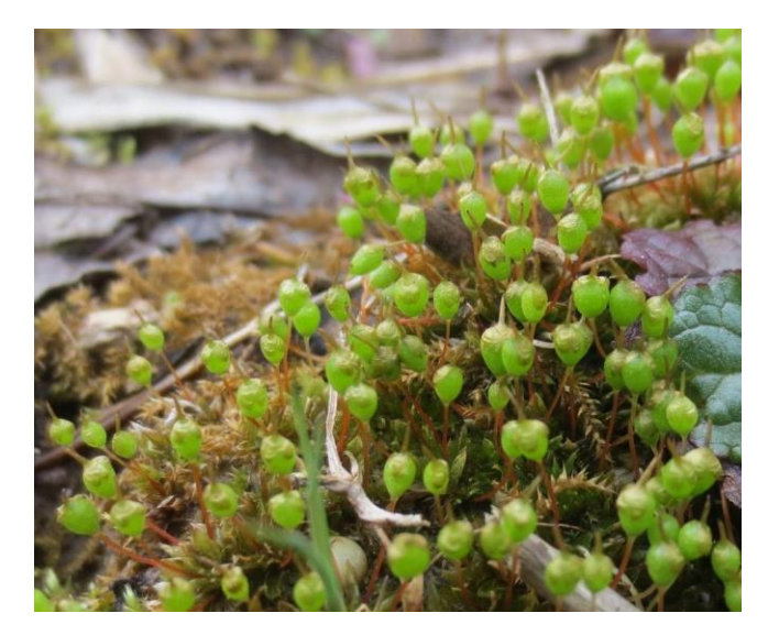
Common Bladder moss Physcomitrium pyriforme, a species that exploits temporary bare wet peat habitat. Clumps of it were common in the fen area in April 2016.

Eventually a different community will establish itself and persist in response to the likely long-term management regime of annual autumnal cut and rake-off. As the future management is unlikely to involve any grazing, species favoured by this (such as those of the early bare peat stage) will decline and disappear back into the seed bank. So it will be goodbye to the bristle club rush for the moment in the knowledge that it is not gone but merely 'asleep' in the peat. Intermittent peat disturbance (the trampling of volunteers during cutting and raking, for example) may bring it back now and again to have a seeding session to maintain its presence in the seed bank.