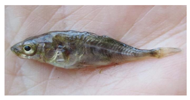
Three-spined stickleback, Gasterosteus aculeatus