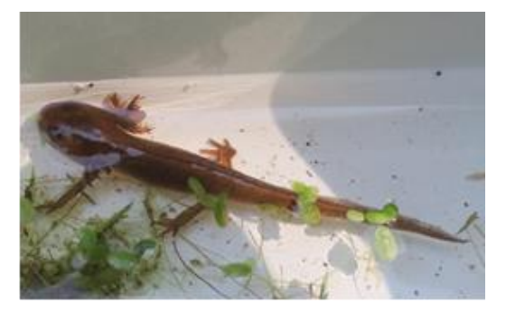
Juvenile smooth newt, Lissotriton vulgaris