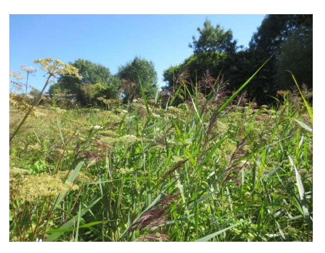
A sea of wild angelica flowers,