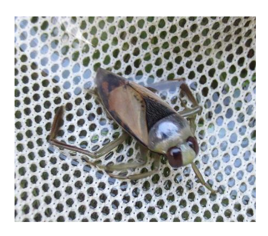
Greater water boatman, Notonecta glauca